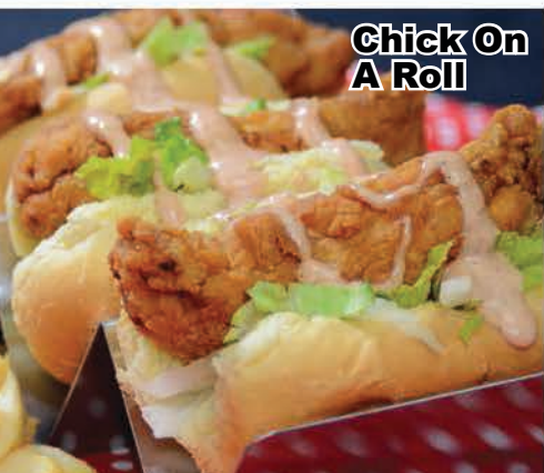
Chick On A Roll

Half pound of deep-fried frog legs, hushpuppies, cherry mustard sauce and lemon. 9.88 Try them as an appetizer. $8.42