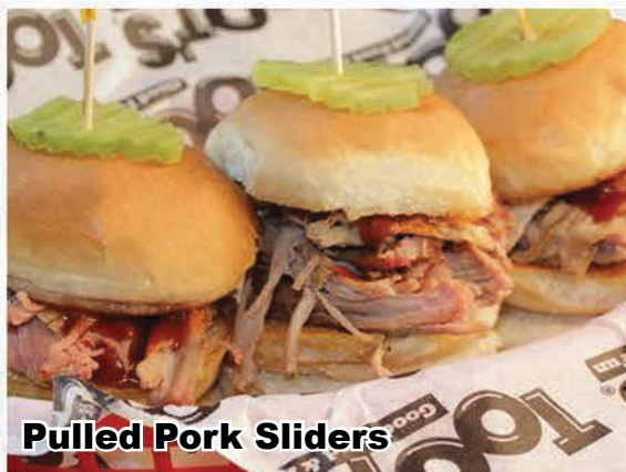
Pulled Pork Sliders