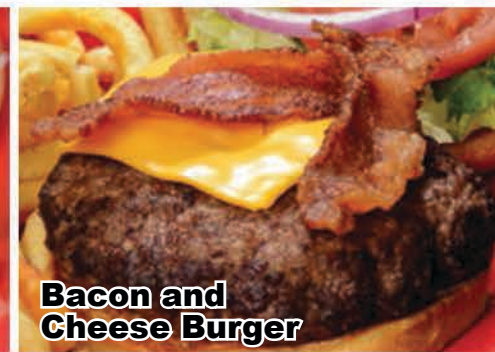
Bacon and Cheese Burger