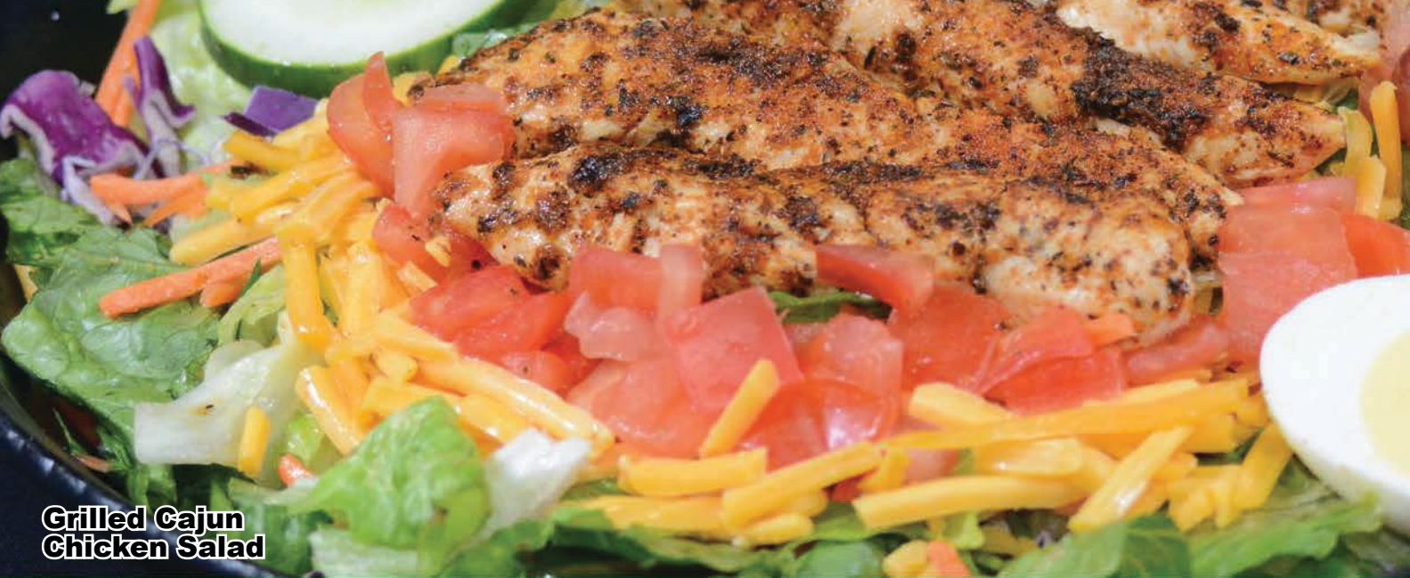
Grilled Cajun Chicken Salad