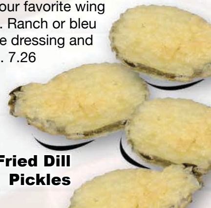
Fried Dill Pickles

Popcorn shrimp flavored with your favorite wing sauce. Ranch or bleu cheese dressing and lemon. 7.26