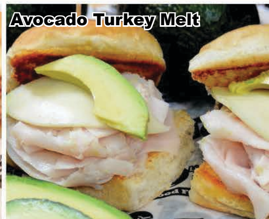
Avocado Turkey Melt