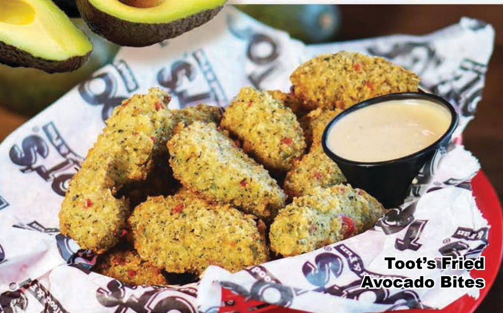
Toot's Fried Avocado Bites