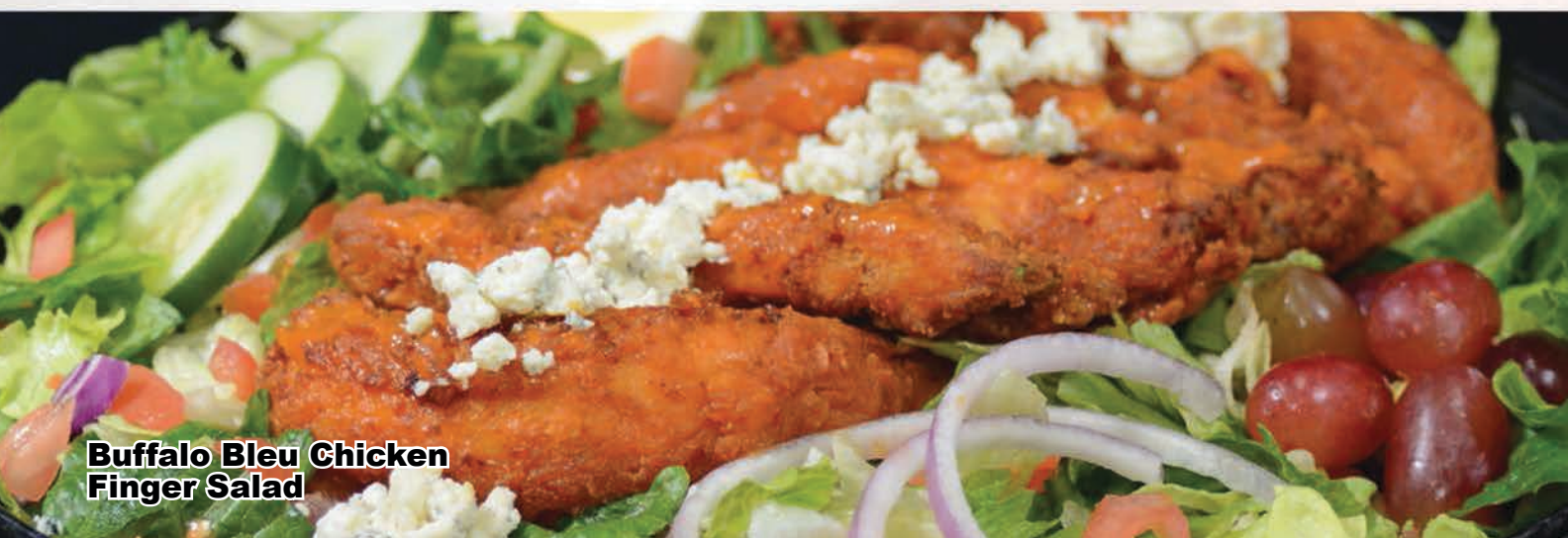
Buffalo Bleu Chicken Finger Salad