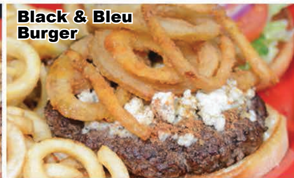
Black & Bleu Burger