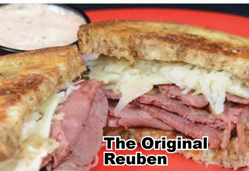
The Original Reuben

Our #1 burger! Topped with bacon, cheese and barbecue sauce. 9.87