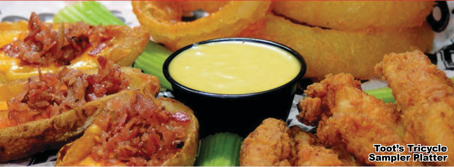
Toot's Tricycle Sampler Platter